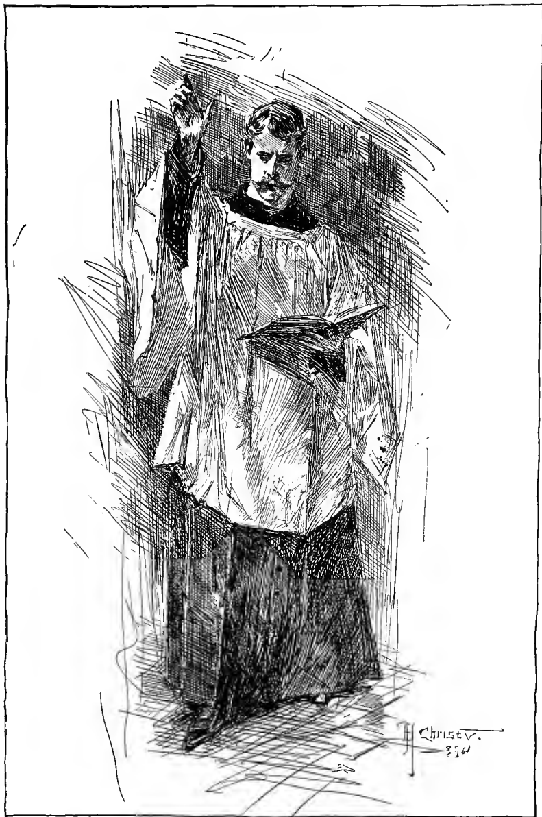
With cravings pale For church and stole and sermons of my own. See page 301.